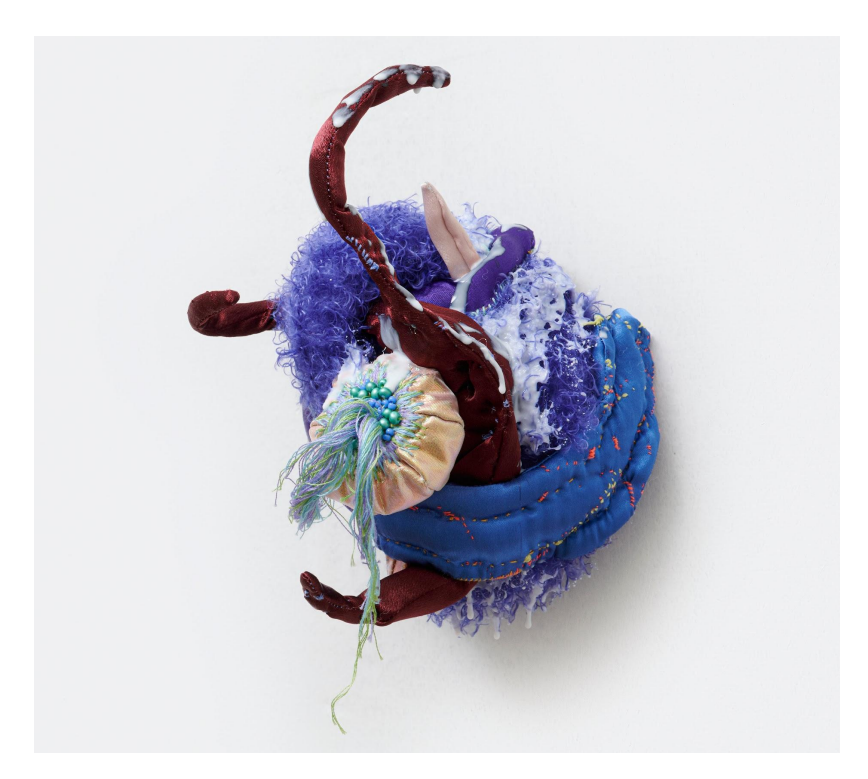
Woo Hannah, A Smelly Ear 냄새나는 귀, 2024, Fabric, cotton, silicone, thread, beads, 21 x 14 x 14 cm.

discovering that one of her kidneys had shrunk abnormally in 2019, Woo Hannah began a journey of self-exploration through the creation of fabric bags that mimicked the shape of various organs. The resultant fabric sculptures NYX , Nidation and A Smelly Ear come to express the complex feelings of loss and possessiveness.